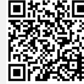
Video of using InvenTech Connect

* Note Operation of the electronic conferencing system and InvenTech Connect systems. Check internet of shareholder or proxy include equipment and/or program that can use for best performance. Please use equipment and/or program as the follows to use systems.