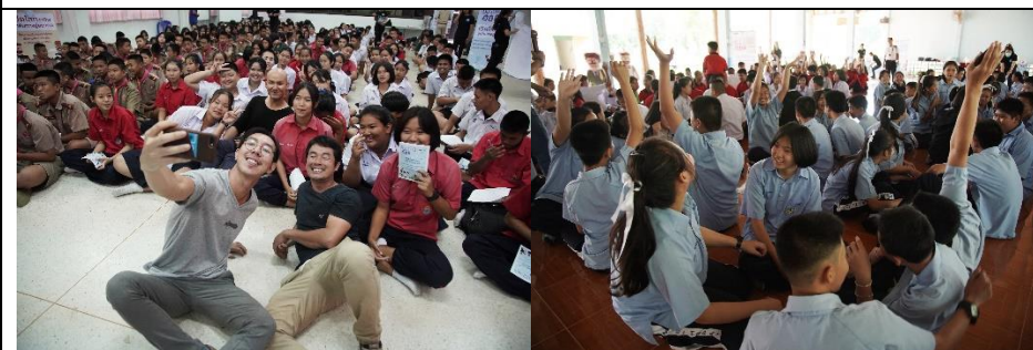
Students while enjoyably listening to friendly guidance from career role models.