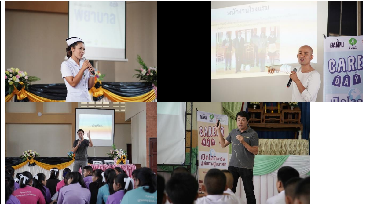
Career role models from many professional fields while sharing their experience with the students participating in the activity.